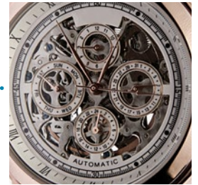
Transparent ceramic phone/watch tops