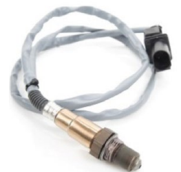
Ceramic coatings – sensors