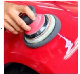
Car polishing pastes