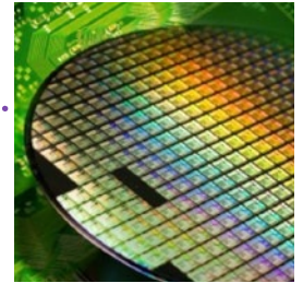
CMP for microelectronics