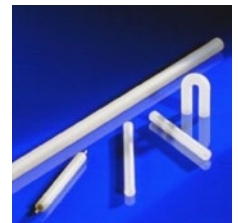
Translucent ceramics - PCA