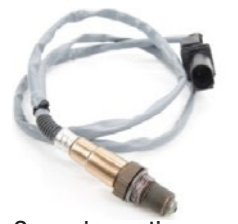
Ceramic coatings - sensors