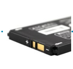
Li-ion batteries separators coatings