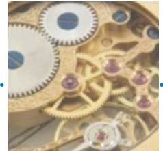
Colored ceramics - watch parts