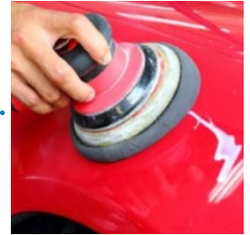
Car polishing pastes