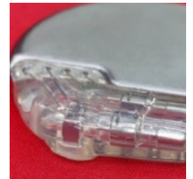
Medical plastics polishing