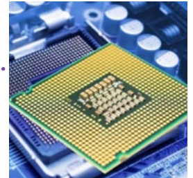
Thermal adhesives - electronics