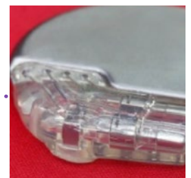
Medical plastics polishing