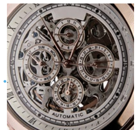
Transparent ceramic phone/watch tops

Typical values are given by Baikowski as an indication only. Such values are not contractual.