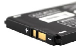
Li-ion batteries separators coatings