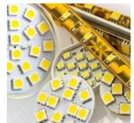
Phosphor coatings - LED