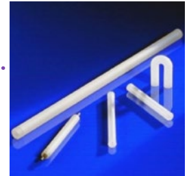
Translucent ceramics - PCA