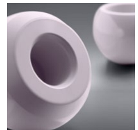
Orthopedic & dental ceramics