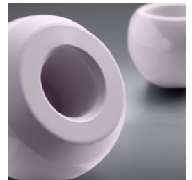
Orthopedic & dental ceramics