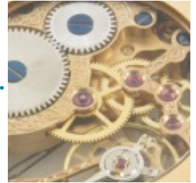
Colored ceramics – watch parts