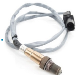
Ceramic coatings – sensors