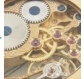
Colored ceramics – watch parts