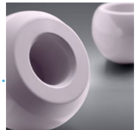
Orthopedic & dental ceramics